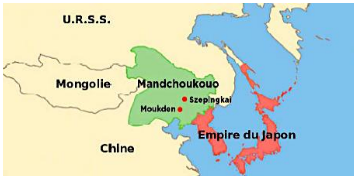
Photo 1 Chart of Manchukuo in 1932.

Even if the climate of Manchuria looks like the one in Quebec, « a little bit colder during winter and a little bit hotter in summer, » that country finds itself today as one of the danger spots of the globe. In fact, four empires overlap. First with China with which that territory historically is connected, the «Three Provinces of the northeast» is the official term to speak about Manchuria in China; then the United States that include Manchuria in their politics in the Far East; then the USSR, heiress of the Russian empire, and finally Japan that jostles to install there a colonial empire that competes with the great occidental empires.